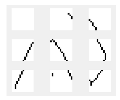
Fig. 2. Image segmentation divided into nine segments