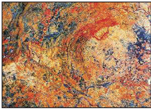
FIGURE 1 Aerial view of the Vredefort Dome – South Africa

authors as relevant in terms of economic growth, job creation, income for local governments (see also Dwyer et al. 2003:431) and catalysts for other sectors such as agriculture, forestry, and fishing (Curtin 2003:173; Finkler & Higham 2004) and the manufacturing industries, as well as infrastructure development for the local community (Han et al. 2003:153). Early research from other disciplines such as anthropology (Smith 1977), geography and sociology also plays educational roles in the fields of different ideologies, culture, national heritage, the environment, political differences and cross-cultural attitudes towards an integrated development process. Careful assessment and implementation of policy tools to minimise negative impacts on social attributes constitutes an important component of integrative tourism planning in rural settings.