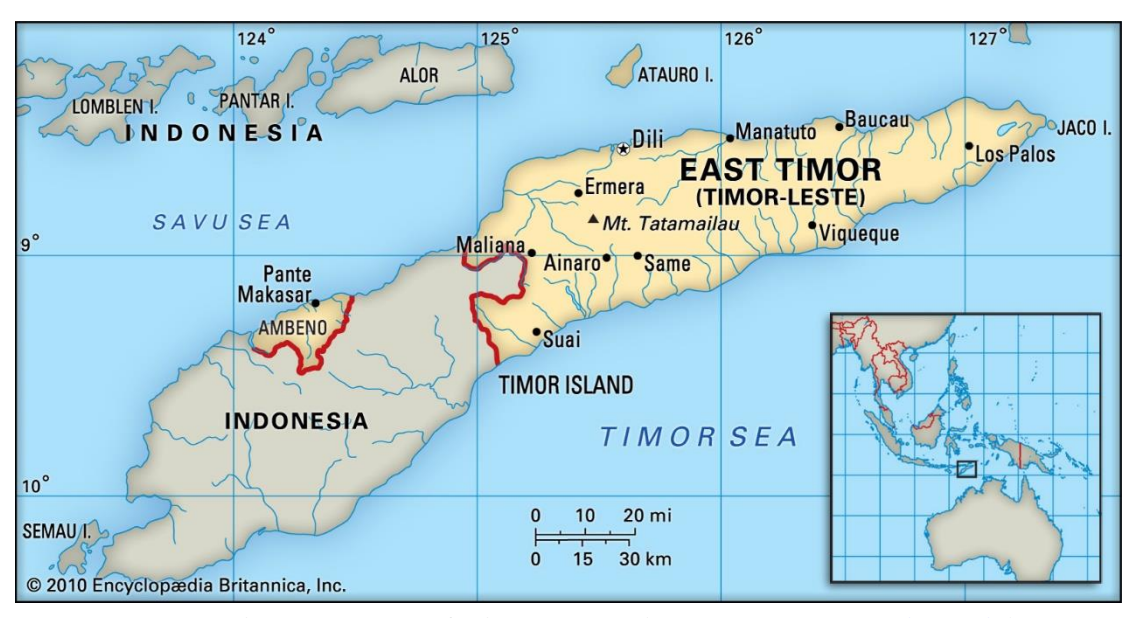
Figure 1: Map of Timor Leste

the most-eastern part of the Lesser Sunda Islands. 90 It is bordered with Australia and Indonesia to which it occupies an area of 14,874 km<sup>2</sup>. It is inevitable that Timor Leste lies upon the region of Southeast Asia, which indefinitely fulfills the first requisite of joining ASEAN under the Charter. Figure 1 below displays the location of Timor Leste in the region of Southeast Asia: