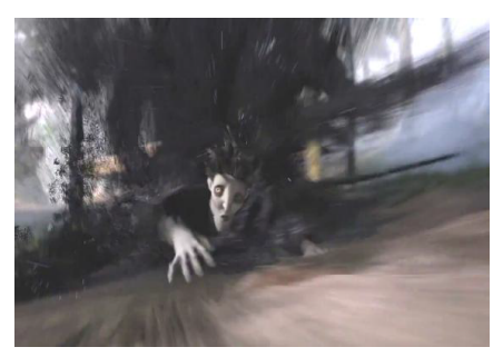
Figure 10 The end of the Bogeyman; Mother Earth devours him.

the last scene where all nightmare creatures he has created turn against him, and earth devours him in an abyss.