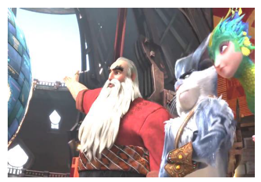
Figure 8 The guardians regard the moon as a sacred celestial body.

Unlike the guardians, Pitch or Bogeyman considers the moon as the one that causes his misery; a longing to be