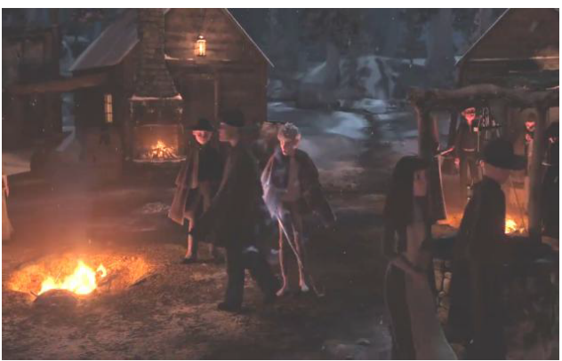
Figure 1 Jack Frost is a hollow man that no one can see

From archetypal perspective that is from initiation archetype, the film shows Jack Frost undergoes initiation to become a member of the guardians. The phases that he is to experience are separation, transition, and incorporation. In separation phase, it is said that initiates are separated from the everyday routine of life and their previous social statuses. This can be done by moving the initiates geographically or stripping the initiates from physical markings of their previous selves such clothing, hair and the like (Hanson, n.d., para 3-4). In early parts of the movie, Jack Frost is depicted as a merry-making loner. He is separated from non-fairy world realities wherein people are not aware of his presence. He is like a hollow man for people cannot see and hear him as can be seen in Figure 1.