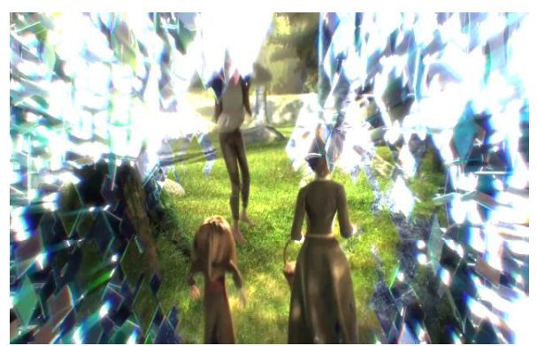
Figure 4 Jack Frost recalls his past memory with the help of Baby Tooth

When looking at his past, Jack Frost realises his own character that is suitable for being a guardian. He understands that he can be the guardian of children because he saved his sister in his previous life. He saved her from falling into a deep frozen lake. Nevertheless, he is aware that he cannot be a good guardian if he cannot