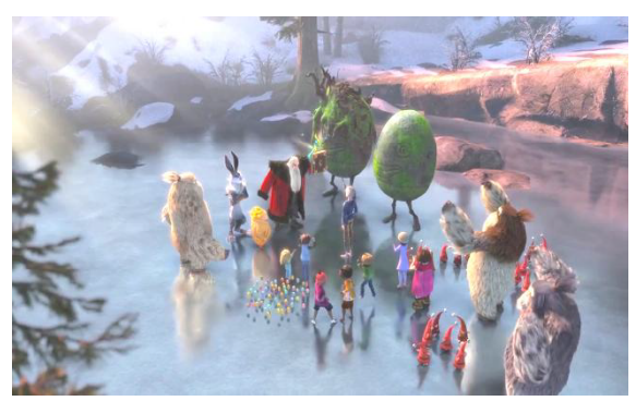
Figure 6 The final incorporation of Jack Frost as a guardian

formal ritual procedures (Hanson, n.d., para. 8). A physical marking that signifies the new positions may be given. The procedures also serve as a public announcement that the initiates are now belonged to the new group (Prevos, 2011, para. 8). In the movie, the incorporation phase starts when Jack Frost regains his old staff. The fact that he is visible now to children also signifies this phase. The incorporation phase reaches its prominent moment when the guardians and the children are gathered to witness Jack Frost taking the oath to protect the children and become the guardian.