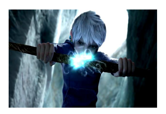
Figure 5 A symbolical shot of Jack Frost gaining his identity and confidence

prove himself and others he could fulfil the duty of a guardian. Therefore, he has to demonstrate his skills and abilities. In the scene that follows, it is symbolically depicted by fixing his broken staff. This is the moment when he regains his own power and confidence.