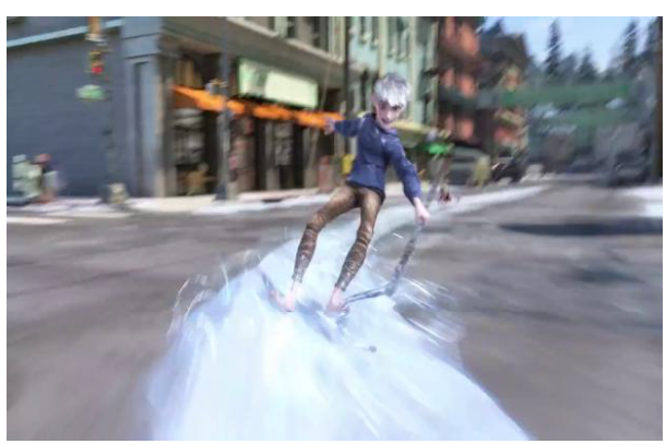
Figure 2 Jack Frost is having fun with Jamie in snow track he creates

The narrative develops as he is chosen to be a new member of the guardians who is predicted by the moon to be able to defeat the Pitch Black. However, only by being chosen does not automatically make him a guardian. He has not been separated from his previous nature; a mere snowmaker who only knows about having fun.