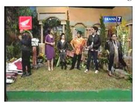
Gambar 3: Logo Iklan Honda