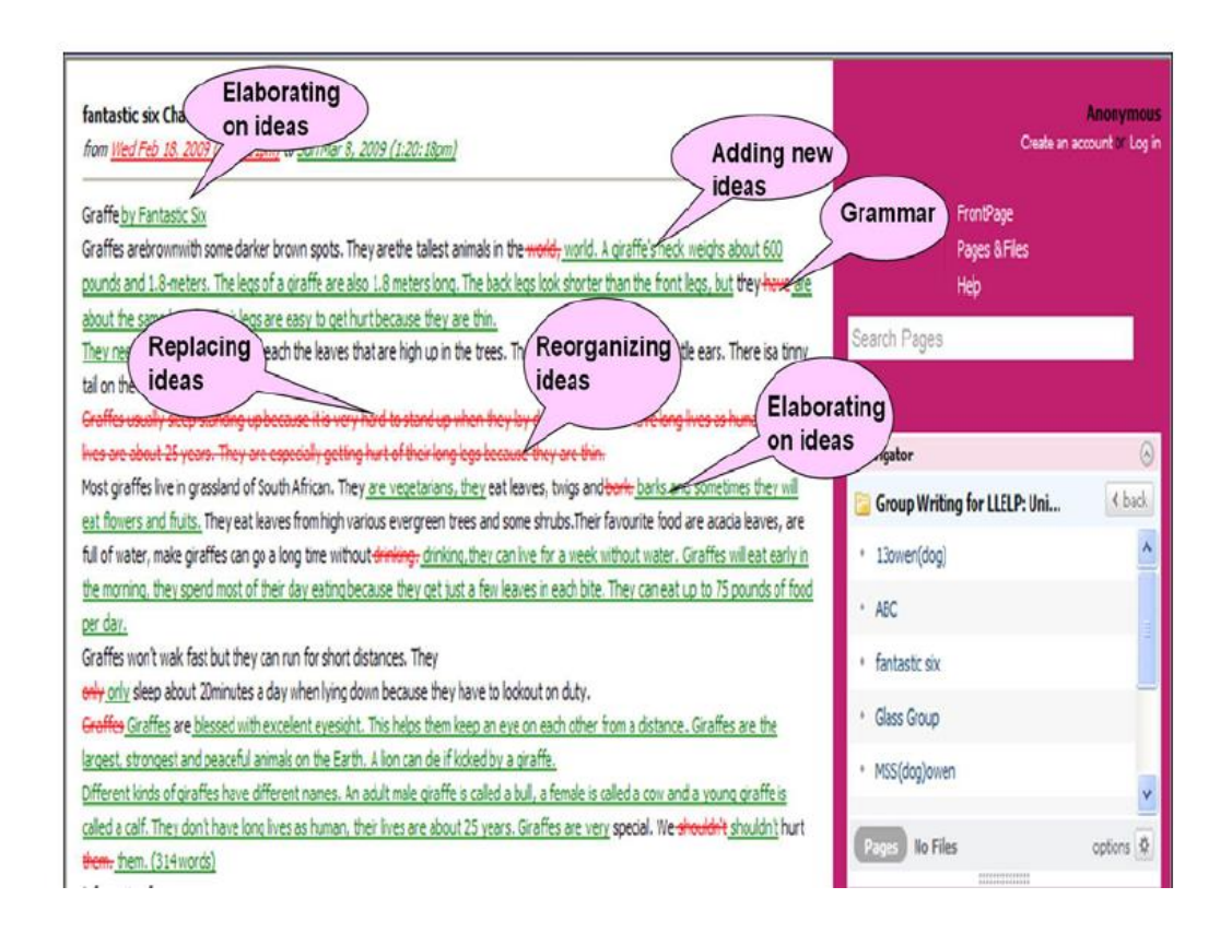
Figure 1. Excerpt from wiki tracking system (Woo et al., 2011)