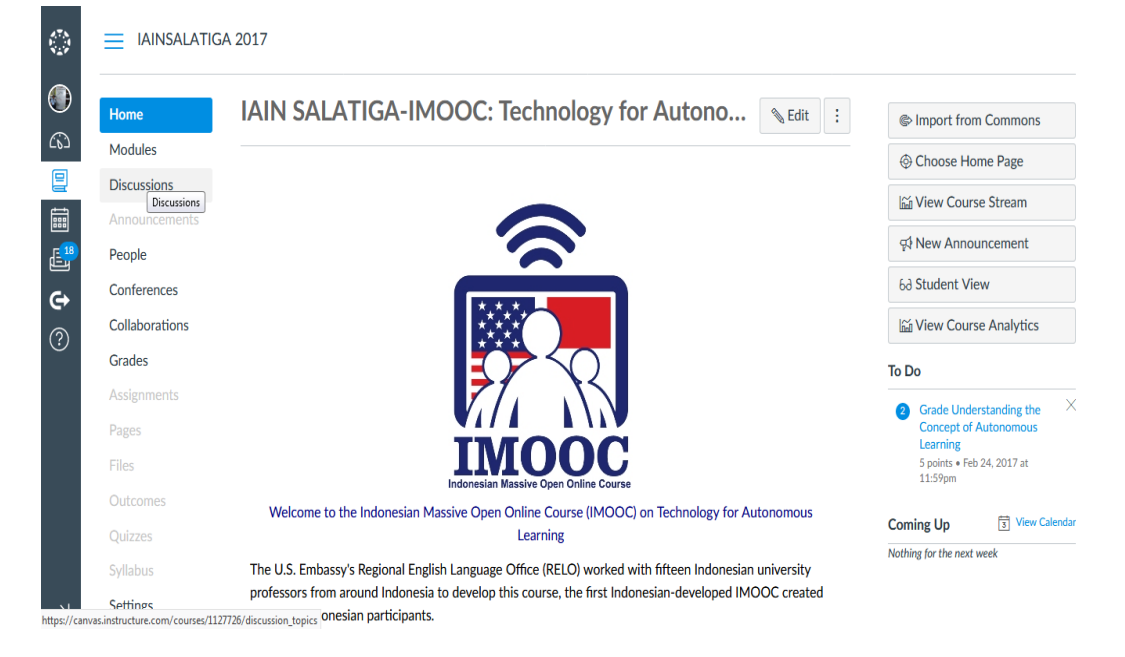
Figure 1. (Teachers' view to the Canvas)

Thanks to designers of the Canvas that I did not have many difficulties working with the app in designing the IMOOC. Canvas is also a very userfriendly app for me to develop as well as to facilitate an online course. I cannot say whether this is a strength or a weakness but Canvas works best if the users log in with the gmail account because then Canvas can also connect smoothly with other communications tools provided by google such as google drive, google forms, youtube, etc. As a designer and a facilitator I can also swift from teacher's view to the Canvas (Figure 1) to students' view of the Canvas (figure 2) so it helps me predict what may happen with students learning experiences when the course is launched or the learning materials are published. I can check whether the links to youtube video, for example, is easily accessible by the participants.