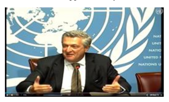
Figure 2.Press Conference release of Filippo Grandi's report

A recorded press conference video release of Filippo Grandi – UNHCR Head Commissioner, entitled "Rohingya Refugee Emergency in Bangladesh, Geneva, 27/09/2017" is accessible on United Nation official webpage, please visit (http://webtv.un.org/watch/filippo-grandi-unhcr-press-conference-rohingya-refugee). Length of the video is approximately 27 minutes and 30 seconds. The press conference is led by a moderator, reported by Filippo Grandi – the UNHCR Head commissioner as the keynote speaker, and followed by six follow-up questions which come up from the audiences in that press conference room. Moreover only the utterances uttered by Filippo Grandi were taken as the data. The oral utterances were transcribed into text form; in order to easier the process of analysis, without omitting even a word he uttered, then obtained approximately 395 clauses.