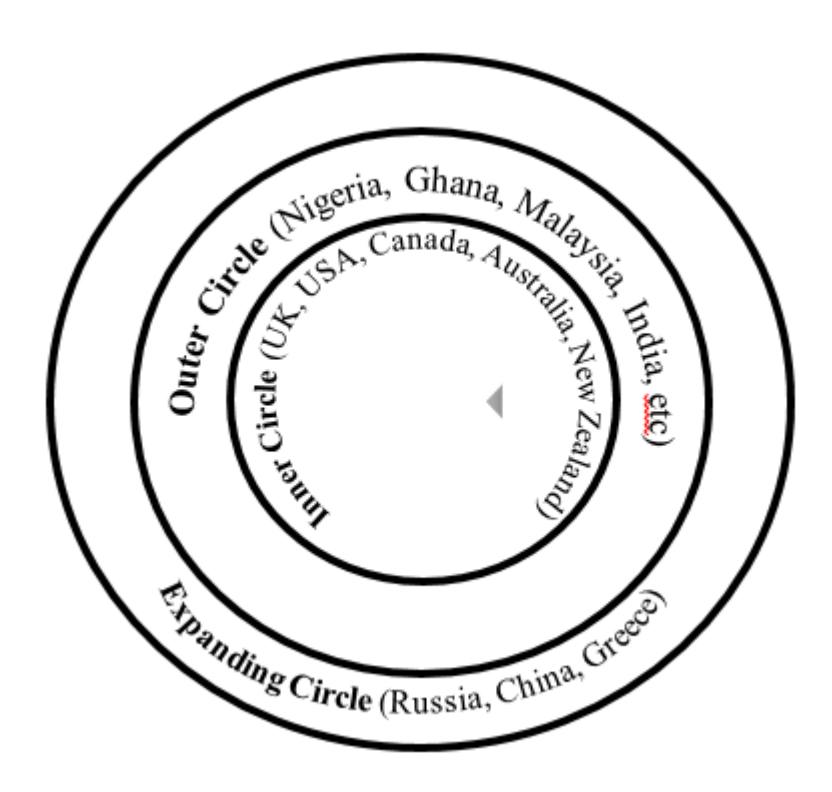
Fig. 1: Kachru's Concentric Circles of World Englishes