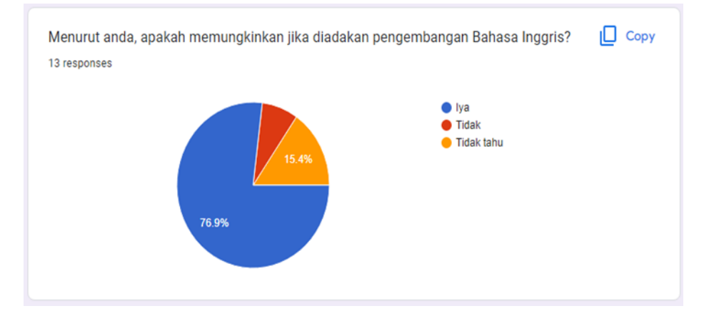
Picture 2. The locals' perceptions towards the development of English

We found various responses or beliefs of the participants to the likelihood of English to be introduced in that place. The first question is that "Based on your opinion, is it possible to develop English langguage in Langger Dhatang area?". The following chart illustrates their responses: