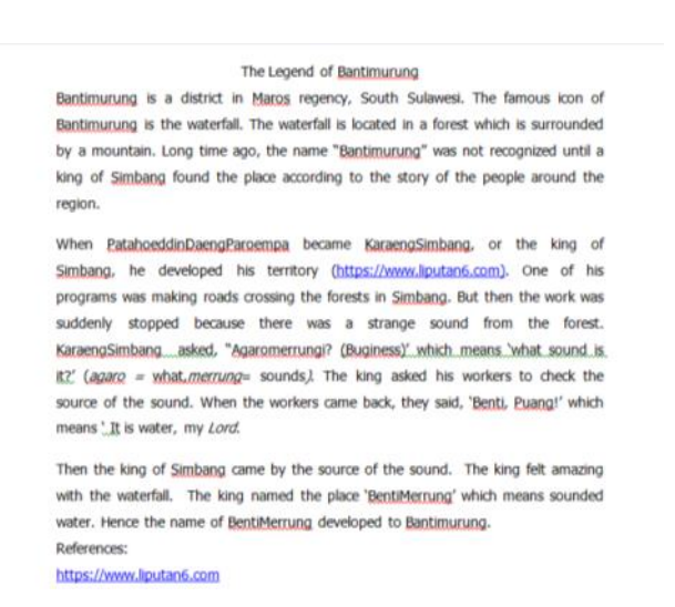
Figure 1. Samples of reading materials used by Teachers 1 (Kurniawan & Arment, 2016) and 2 (Idris, 2018)