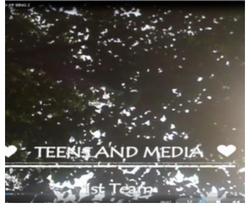
Figure 2. Samples of videos materials: timing (Kartohatmodjo et al., n.d.) and teens and media (Hedianti et al., n.d.) containing local social and cultural values which are created by the students

The third role of EFL teachers is the activities designer ( R6-T3-C2 ; R6-T3-C2 ; R61-T1-C2 ). The data show that EFL teachers are not only creating or enhancing materials but also setting relevant activities ( R6-T3 ; R6-T2 ). Teachers 2 and 3 are fitting perceived cultural learning needs/interests, materials, and activities. Teachers' job is ensuring the coherence of their teaching practices (Hammond, 2006, p. 97). Teacher 3, for instance, designs activities cycles of reading-writing-creating video containing specific social-cultural messages. Teacher 2 creates some narrative texts, questions, and activities allowing the students to extract moral values from the texts ( R6-T2 ). Furthermore, the learning activities are extended into story-telling and competition embedded in students' extracurricular activities.