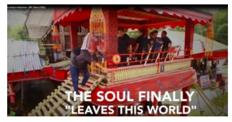
Figure 3 A cultural-based documentary video, "Living with the Dead in Indonesia" (BBC News, 2017)

The data show that Teacher-3 increases students' multi-cultural/cross-cultural understanding and tolerance by using a documentary video presenting cultural ritual/belief from a certain community and creating a cross-cultural forum.