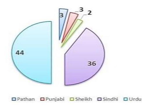
Figure 2. Representation of different ethnicities : Salmonella Typhi Infection