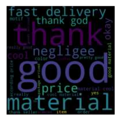
Figure 3. Word Cloud Positive Sentiment

Figure 3 shows the words that appear most often in the positive sentiment class, which are: "good", "thank", "material", "cool", "color", "negligee", "price", "fast delivery", "good material", "according price", "cool material", "thank seller", "pretty good", and others. The conclusion of positive sentiment is buyers quite like the negligee product sold in one of the shops at Shopee. With a reasonably low price, it turns out that the quality is good, and the material is cold when used. The delivery is fast too. The color or motif of the negligee is also following what was ordered.