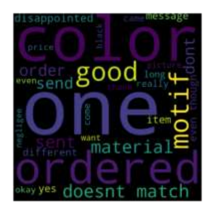
Figure 4. Word Cloud Negative Sentiment

Figure 3 shows the words that appear most often in the positive sentiment class, which are: "good", "thank", "material", "cool", "color", "negligee", "price", "fast delivery", "good material", "according price", "cool material", "thank seller", "pretty good", and others. The conclusion of positive sentiment is buyers quite like the negligee product sold in one of the shops at Shopee. With a reasonably low price, it turns out that the quality is good, and the material is cold when used. The delivery is fast too. The color or motif of the negligee is also following what was ordered.