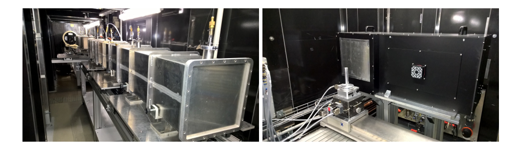
Figure 1: View of V7. Flight path equipped with containers filled with He gas for loss free transport of the neutron beam to the sample position (left). Sample position equipped with translation, tilt and rotation stages. The detector box with active area of 30 cm x 30 cm is behind the sample stage (right).