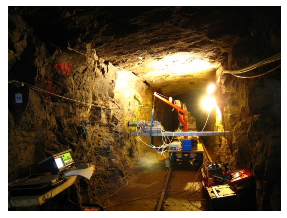
Figure 2: Pneumatic impulse hammer source pre-stressed against the Richtstrecke gallery wall (see Fig. 1).

horizontal and the vertical boreholes of the GFZ Underground Laboratory (Jaksch et al., 2010). The measurement results demonstrate the possibility of focusing seismic wave energy in the desired directions.