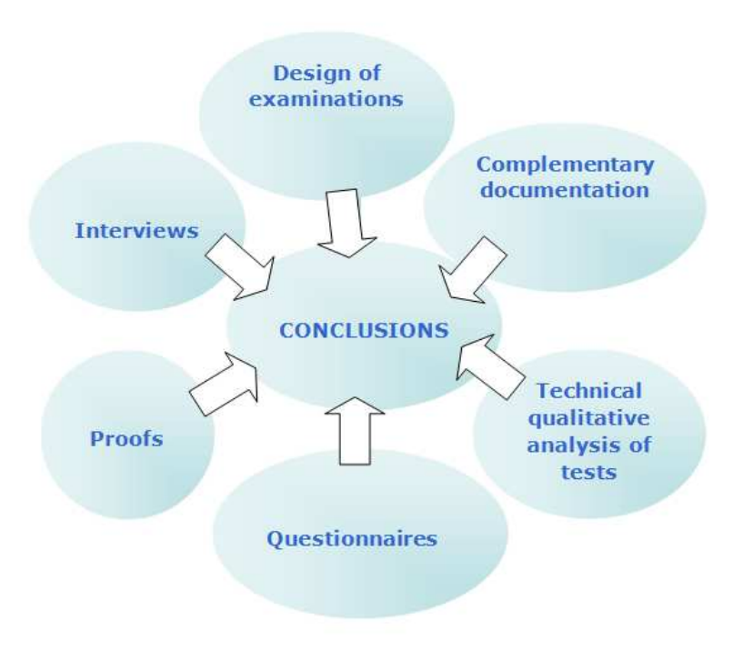
Figure 1. Triangulation of the different sources of information.

Figure 1 shows the different sources of information employed in order to reach the conclusions drawn in this report.