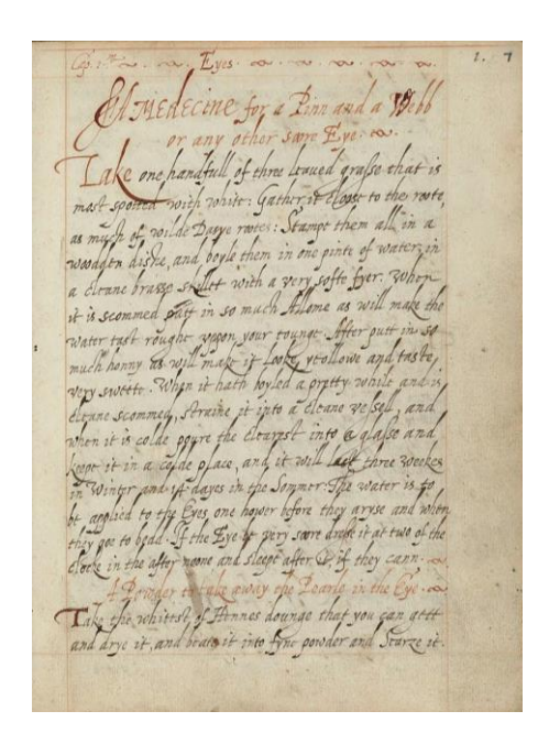
Figure 1. Page 1 of W213ix

In Figure 1, which shows the first page of W213 with recipes, some of the aspects discussed so far, such as ruling, pagination and hand, can be noticed.