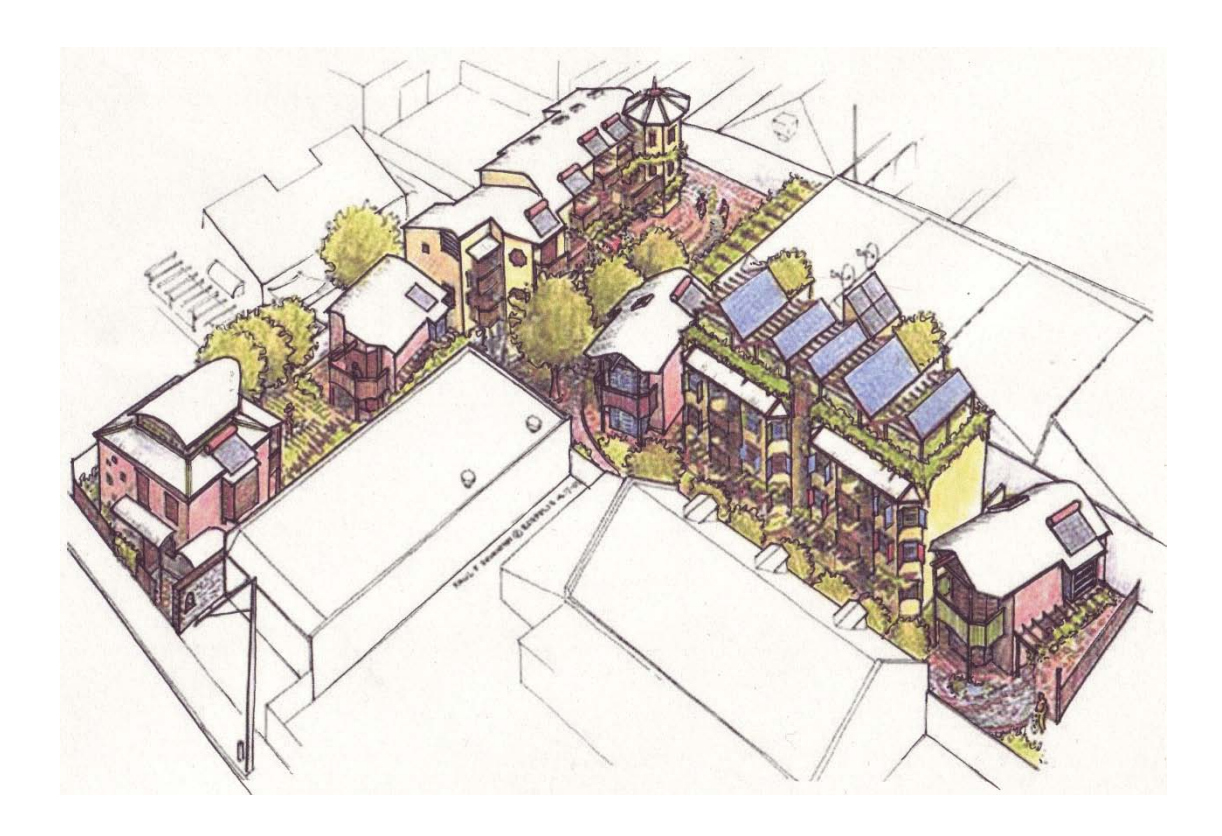
Figure 2 . Ecopolis architects, Elevation of Christie Walk 2004. Courtesy of Ecopolis Architects. A paved courtyard and a further block of apartments has now been completed at the front of the site (lower right of the image).

The construction priorities, from the beginning, were the low environmental impact, and the social sustainability of the site, rather than those of the tight timelines, contained costs and profit motive of the mainstream building and development sector. These aims are visible in design, materials and building processes. A number of the dwellings are deliberately small in size, minimising the use of materials. Recycled materials were used wherever possible. All materials and finishes used in the interiors were considered for their environmental impact during manufacture and beyond. Hence 'non-toxic construction and finishes [were] used throughout, and a policy of avoiding formaldehyde and minimising the use of PVC' was implemented (Downton 2009, p.285). Energy and water conservation measures were built in. A number of the buildings were constructed for long-term survival: the apartment block under the roof garden, for example, has a skin of aerated concrete blocks which are loadbearing and long lasting. The internal apartment walls are not load-bearing and can be moved to create new spaces for low cost, should new owners wish to remodel, making the apartments both long-lasting and flexible. Dwellings and windows are placed in relation to the sun, to reduce energy needs so far as possible, on this oddly-shaped site. The 'skin' (that