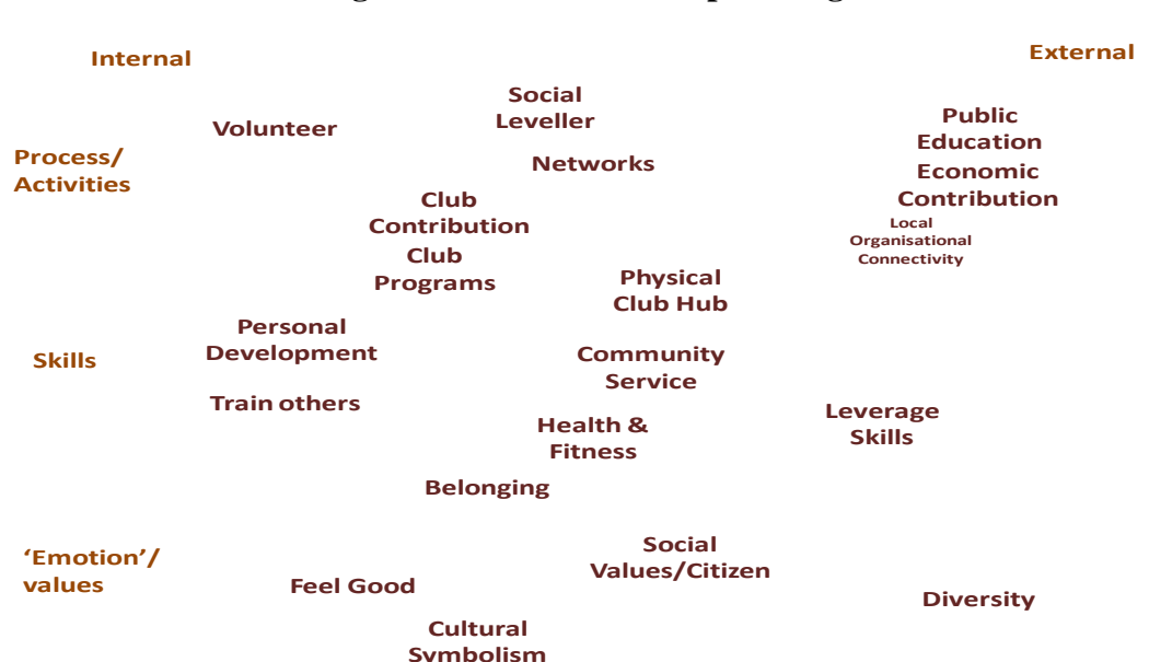
Figure 1: Focus Group Coding Schema

Figure 1 illustrates the overall structure of the main themes in terms of a 'mind map'. Some themes referred to activities internal to the organisation, others more to activities external to the organisation, while many covered both. Some referred to specific activities or processes, others to broader skills, while others referred to broader feelings or values.