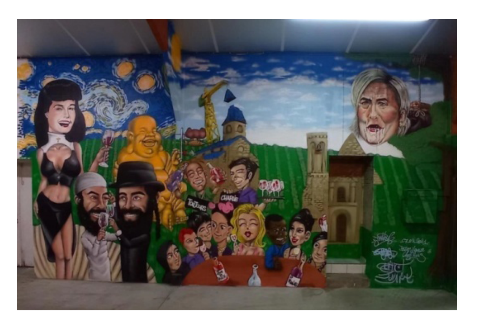
Figure 3. The collaborative mural by Tennch Tcha, The Jamet brothers, Alexandra Bombled Genneteau and Tchuj Tcha; reproduced courtesy of Tennch Tcha

The techniques and skills of graffiti writing were evolving and diversifying in that styles and color palettes changed from realistic to cartoonish and from representational to abstract (Kramer 2017, pp. 12-19). French Hmong artists acquired mature and practical knowledge of creating graffiti. Using letters, drawings, sprayings, characters, and colors, 'you can create anything; there are no limits', Tennch claimed<sup>15</sup>. Much of their artworks employ multiple tools and styles, writing, painting, tagging, and stenciling. Moreover, Tennch's commissioned work stands for the concerns on social issues, for example, immigrant issue in France.