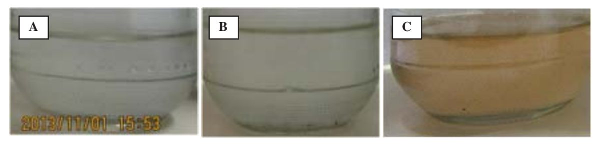
Figure 1. Pitcher liquid of N. rafflesiana : non-induced liquid (NIL) (A), prey-induced liquid (PIL) (B), and chitin-induced liquid (CIL) (C)