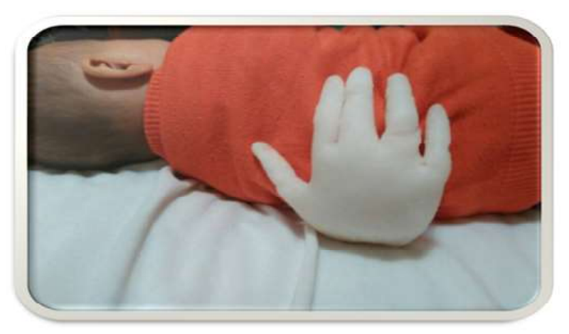
Figure 2. The use of mother's hand tool as a representative in positioning

not normal. The Wilcoxon signed rank test was used to compare two groups of non-parametric data. A p-value of <0.05 was considered to be statistically significant.