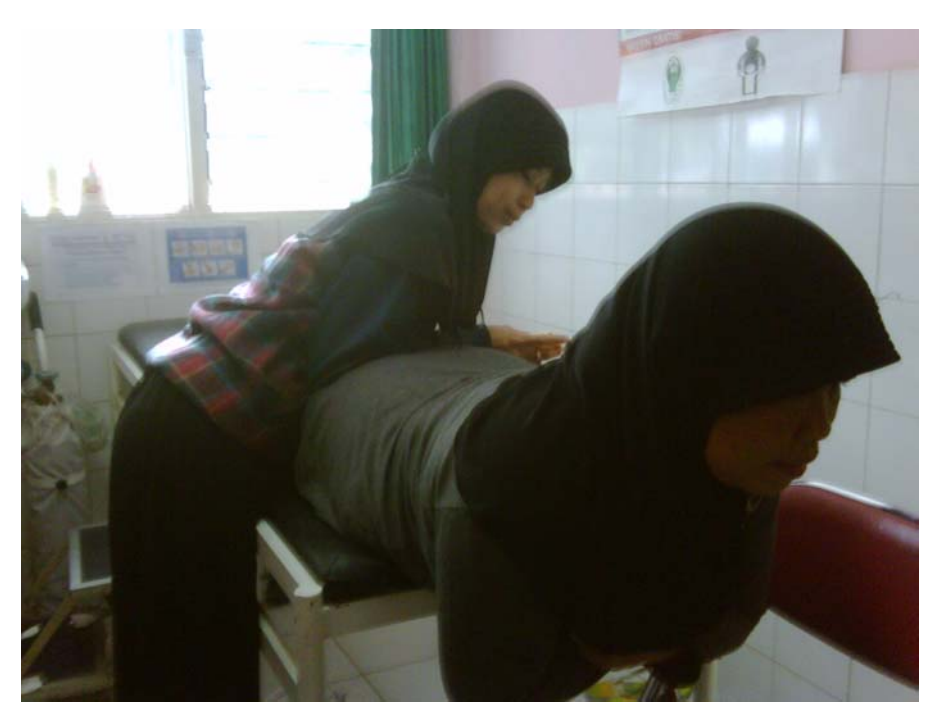
Figure 2. Erector spinae endurance testing

Erector spinae endurance was assessed by the Biering-Sorensen test, which yields a measure of static endurance of the erector spinae. The BSME test measures the elapsed time during which the participant is still capable of maintaining the unsupported upper part of the body in a horizontal position (Figure 2).