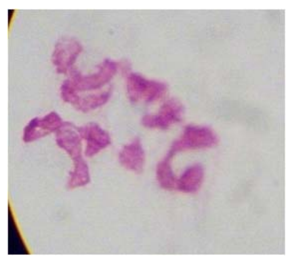
Figure 1. Cuboidal cells in vaginal smear (Giemsa stain, 1000x)