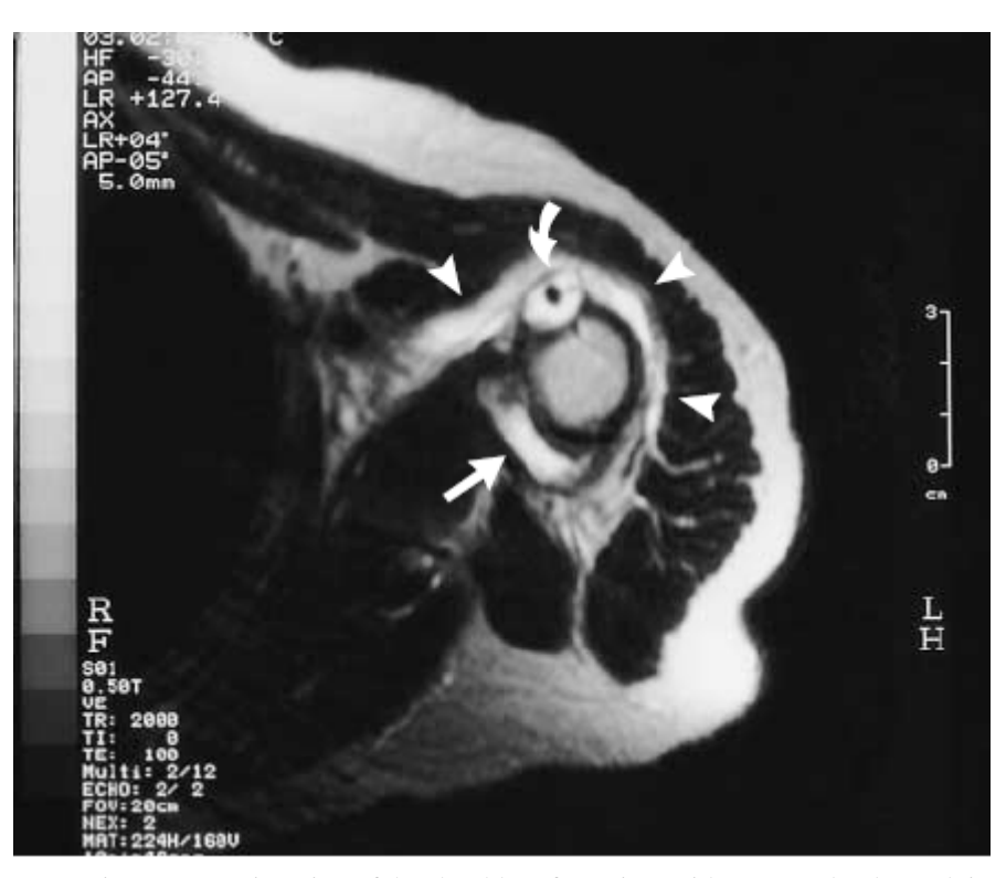
Figure 1. Magnetic resonance imaging of the shoulder of a patient with untreated polymyalgia rheumatica. An axial T2-weighted section shows subacromial and subdeltoid bursitis (arrowheads), joint effusion (arrow), and tenosynovitis of the long head of the biceps (curved arrow). [Reproduced with permission from Dr. Carlo Salvarani].<sup>(2)</sup>

On ultrasonography there is effusion in the bursa of the shoulder joint. (Figure 2).<sup>(2)</sup> The findings on MRI are correlated with ultrasonographic findings, thus ultrasonography is indicated when the diagnosis is uncertain.<sup>(25)</sup>