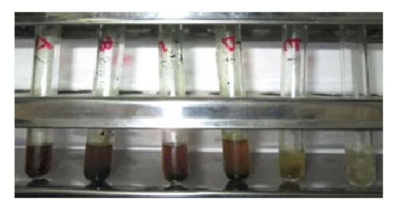
Figure 3. Macrodilution test results (from left to right) of NLE at 1.0 g/dL; 0.75 g/dL; 0.50 g/dL; 0.25 g/dL; 0.125 g/dL; negative control

Observations in the macrodilution test were made after incubating the tubes for 48 hours. No turbidity was seen in the 1.0 g/dL, 0.75 g/ dL, and 0.50 g/dL tubes (tubes 1-3 in Figure 3), signifying absence of visible fungal growth at these concentrations. These results are consistent with the findings of Mahmoud et al., where 5% neem extract in ethanol yielded inhibition of about 44%.<sup>(20)</sup> The higher concentrations of neem extract in ethanol inhibited A.flavus growth to a larger extent.<sup>(20)</sup> The limitations of this study were the difficulties in the preparation of the various concentrations of neem extract, because of the extremely sticky nature of NLE, thus hindering the achievement of consistency of fungal suspension turbidity for each triplicate. The clinical implication of this study is to increase the use of natural resources for healing diseases. We hope that neem leaf ethanol extract can be used as an alternative treatment for aspergillosis. Further studies are needed to determine the antifungal activity of neem extract in other solvents, achieve