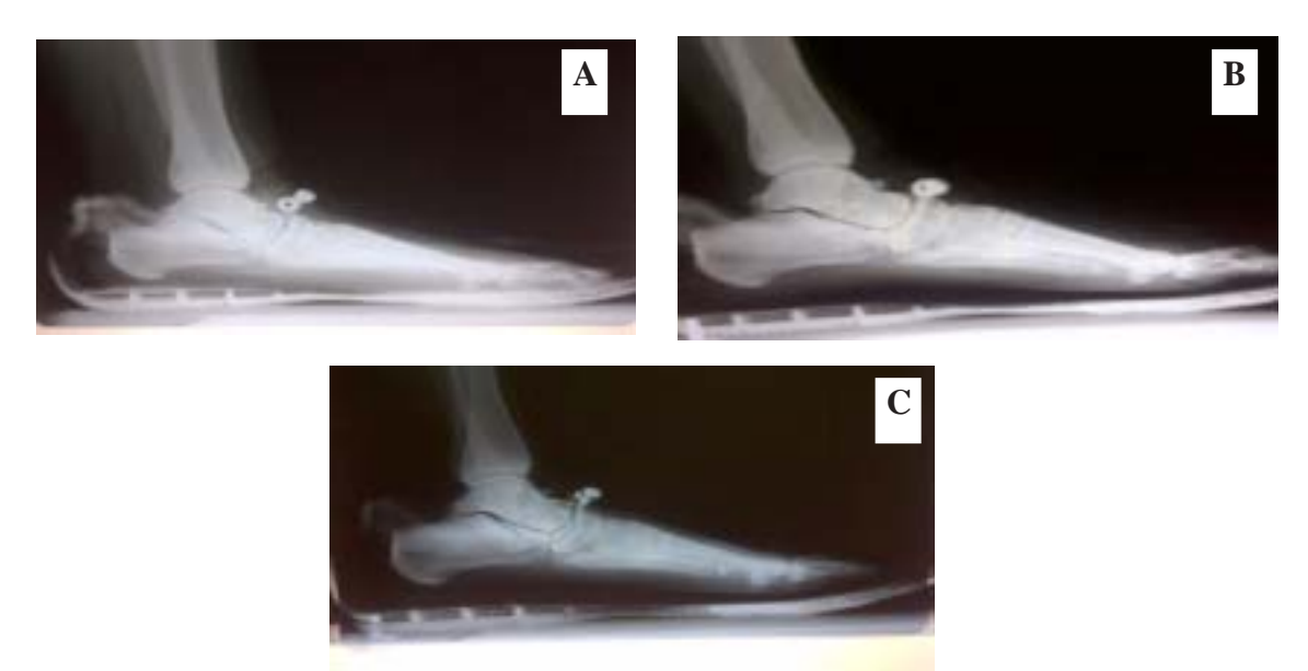
Figure 3. (A) Left subtalar position without orthoses; (B) Left subtalar position with orthoses; (C) Difference in left subtalar height with and without orthoses

functional leg-length disparity, both without and during use of foot orthoses. The computer of the Biodex Gait Trainer 2 automatically measures the distance between two contralateral heel strikes and calculates the mean right and left step lengths.<sup>(12)</sup> Assessment of step lenght by means of the Biodex Gait Trainer 2 was performed in our previous study investigating the effect of step