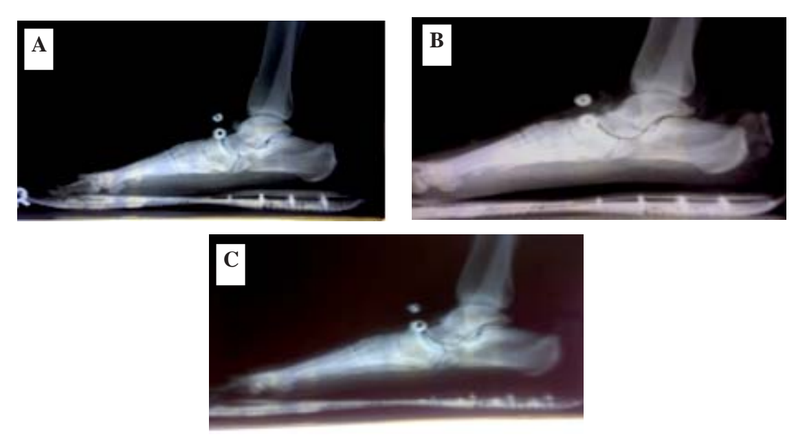
Figure 2. (A) Right subtalar position without orthoses; (B) Right subtalar position with orthoses; (C) Difference in right subtalar height with and without orthoses

The anthropometric measurement used for assessment of pelvic height is the distance from the hip (iliac crest) to the ball of the foot. The pelvis is considered to be straight when the difference between the right and left pelvic heights is small.