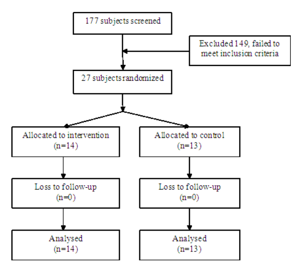
Figure 4. Flowchart of the study subjects

Screening of the 177 subjects obtained 27 subjects meeting the inclusion criteria Figure 2.