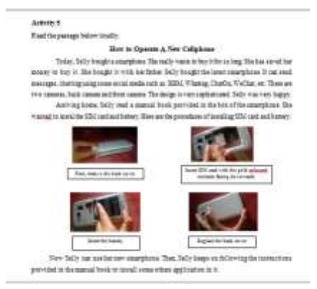
Figure 2. Sample of Activity in "Critical English" Textbook

every chapter with another one. Picture 2 is one of the examples of activity in the "Critical English" Textbook.