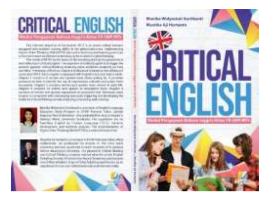
Figure 4. Critical English Textbook

Information, Simple Present Tense, Descriptive Text, and Procedure Text. Figure 5 is the look of Critical English textbook.