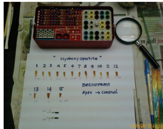
Figure 3. Measurement of apical leakage in Hydroxyapatite.