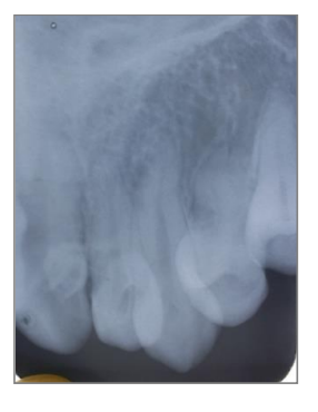
Figure 3. Periapical radiograph illustrating a widenend periodontal space between teeth 21 and 22.