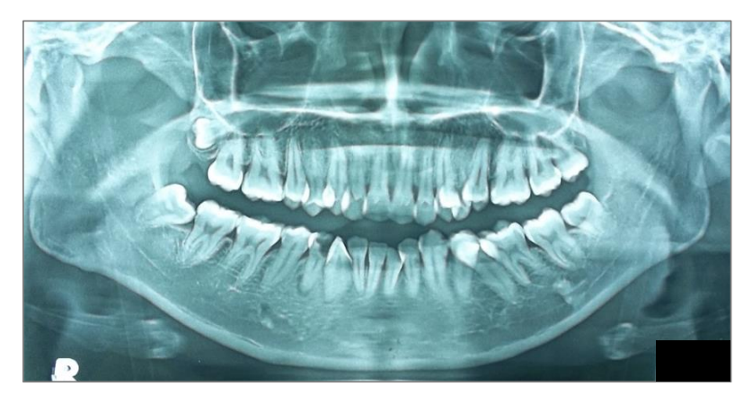
Figure 2. Panoramic view indicating normal appearance.