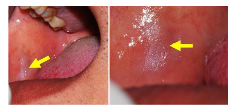
Figure 1. Clinical finding of white lesion on right buccal mucosa (see yellow arrow).

Based on the patient history and clinical examination, it was determined that the white lesion was suspected leukoplakia. Thus, an excisional biopsy (Figure 1) was scheduled. As shown in the panoramic radiograph (Figure 2),