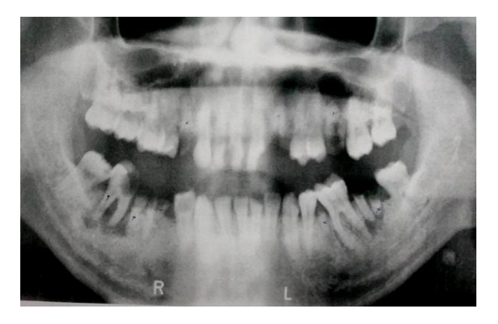
Figure 2. Panoramic radiograph.

Dental Journal (Majalah Kedokteran Gigi) p-ISSN: 1978-3728; e-ISSN: 2442-9740. Accredited No. 32a/E/KPT/2017. Open access under CC-BY-SA license. Available at http://e-journal.unair.ac.id/index.php/MKG DOI: 10.20473/j.djmkg.v53.i3.p159–163