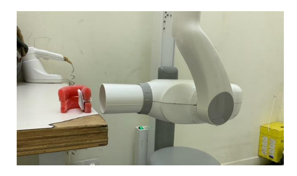
Figure 2. The process of making bitewing radiography with the silicone loop.

If the assessment of the bitewing radiograph quality with the silicone loop is said to be good, the next step will