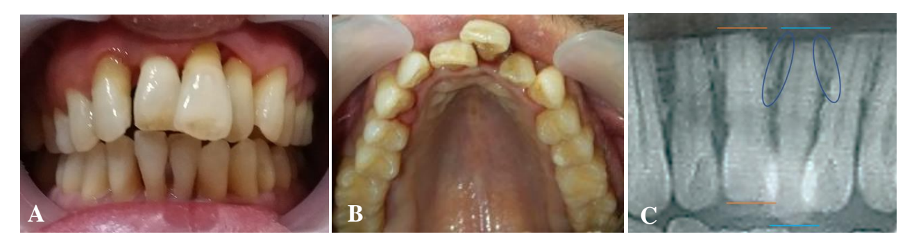
Figure 1. Pre-treatment intraoral facial view (A), upper occlusal view (B) and dental radiograph showed extruded left central incisor (blue lines) as compared with the neighbouring tooth (orange lines) (C).

The treatment started using Roth self-ligating brackets with a 0.022 x 0.028 in the slot. Bonded orthodontic molar tubes were used because poorly adapted molar bands could harm the periodontal tissue. The treatment began with