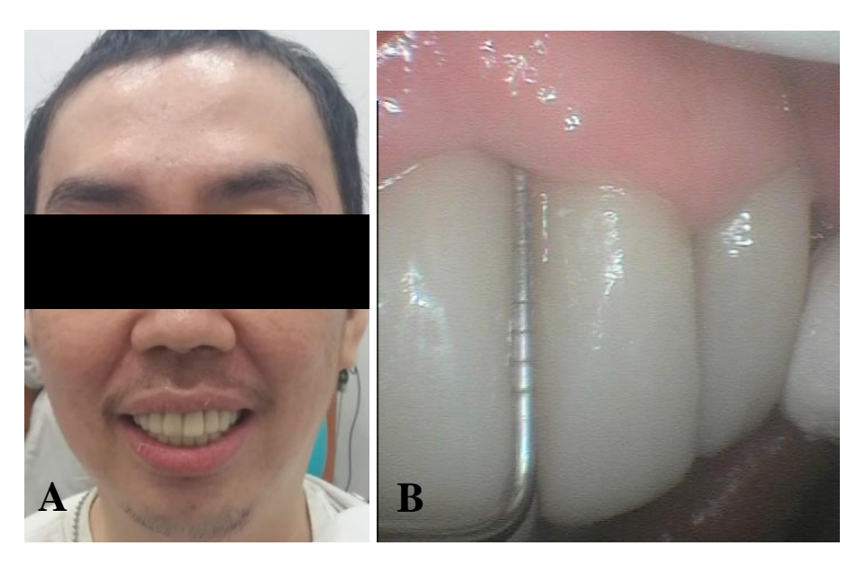
Figure 5. Post-treatment extra oral-facial view (A) and normal probing depth (2 mm) on left central incisor without any sign of inflammation during four-month control (B).

0.012-in, 0.014-in, 0.016-in and 0.016 0.022 in NiTi to align and level the teeth with light force for nine months. Gradually, the left central incisor was intruded and brought to the occlusal plane (Figure 4A).