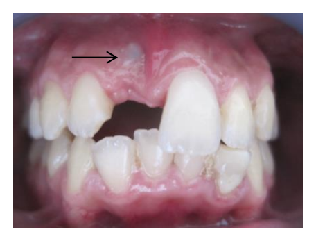
Figure 1. The implant on #11 was detected on labial aspect (seen by arrow).

From clinical examination, the operator found that patient had an average smile line and thick periodontal biotype. Periodontal parameter was evaluated and the oral hygiene index-score (OHI-s) was 1.7 (based on Silness and Loe).<sup>9</sup> Pocket depth on labial was 5 mm. Bleeding on probing score was negative. Implant thread was exposed on the labial aspect. No mobility and suppuration were found.