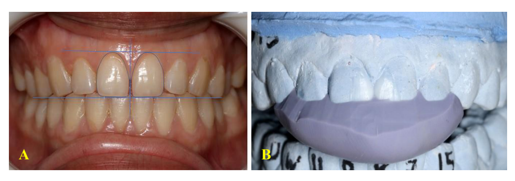
Figure 2. Digital smile design (A), diagnostic wax-up and silicon guide (B).