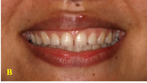
Figure 1. Clinical smile of the patient showed a central diastema (A and B).