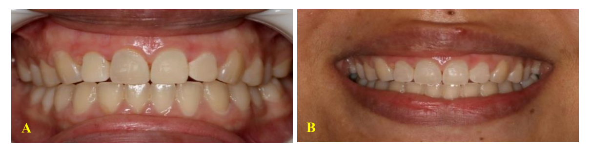
Figure 4. Clinical smile of the patient showed a central diastema closure after the treatment (A and B).