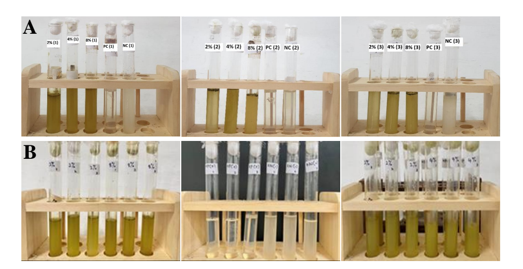
Figure 1. Observation results of the andaliman extract mouthwash dilution test with three repetitions: A. Streptococcus sanguinis ; B. Staphylococcus aureus .

Post hoc LSD tests on antibacterial activity against Streptococcus sanguinis revealed that the concentrations of 2%, 4%, 8%, and a positive control had no significant differences (p>0.05) in each concentration, while the negative control group showed a significant difference (p<0.05). Meanwhile, LSD tests on antibacterial activity against Staphylococcus aureus showed that the concentrations of 2% and 4% and 4% and 8% had no significant difference (p>0.05). At the same time, in the other group, there were