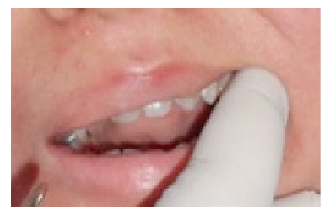
Figure 2. The palpation of lateral pterygoid muscle.