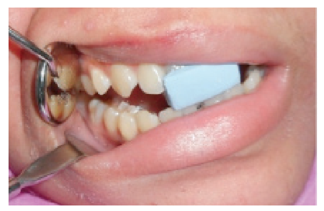
Figure 8. Disoclusion of right posterior teeth.