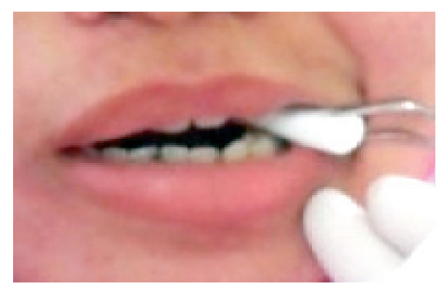
Figure 3. Cotton roll clench test.