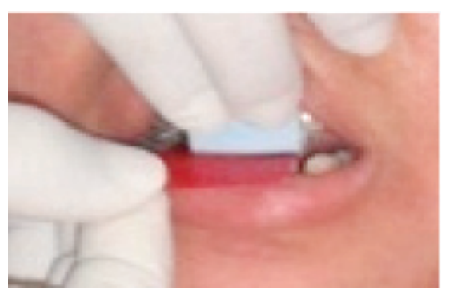
Figure 5. Adjusting with articulating paper.