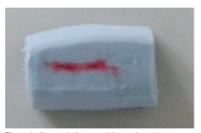
Figure 6. Symmetrical contact with opposing teeth.