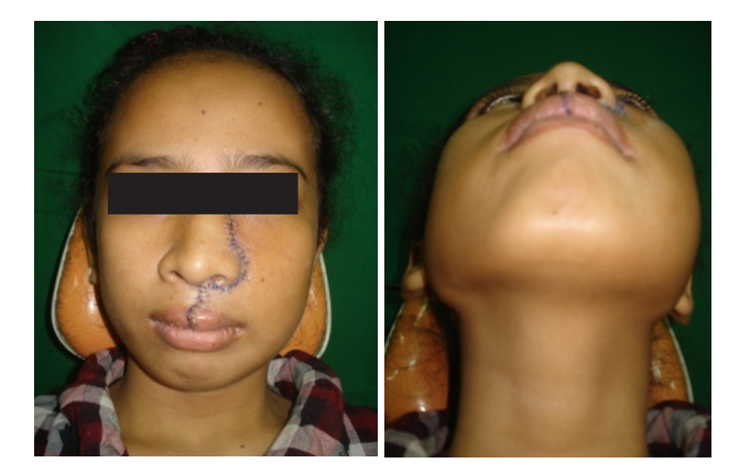
Figure 5. Day-9 Postoperative extra oral view. From frontal and lower view showed no difference between left and right facial and zygomatic area.