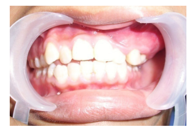
Figure 2. Preoperative intra oral view. Noted over left cheek, a mass with unclear border and elevated of nasolabial sulcus.

Extra oral examination showed facial asymmetry, a mass was noted over the left cheek with unclear border, showing smooth surface and normal color (Figure 1). Intra oral examination showed elevated nasolabial sulcus, a mass was seen over both the palatal and buccal aspect from canine to upper first molar, 4 \times 6 cm in size, solid hard and tender on palpation. There was a pus and salty discharge from the mass via drainage in the buccal mass. There were no loose teeth and no dental caries observed (Figure 2).