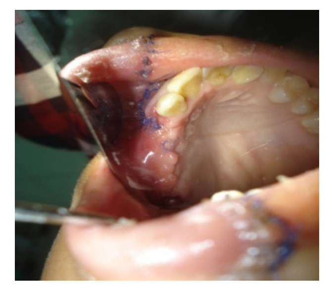
Figure 6. Day 9 postoperative intra oral view. The mucosa had normal color and well sutured.