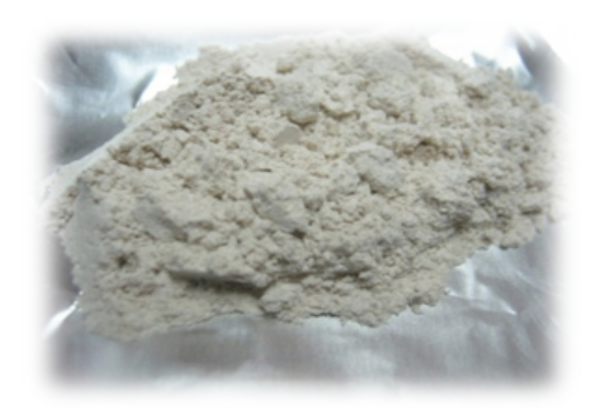
Figure 1. Natrium alginate powder of Sargassum sp.

Maximum water content of natrium alginate which had required by Food Chemical Codex<sup>7</sup> is 15%. The content of natrium alginate in food is at least 13%<sup>8</sup>. According to the research,<sup>9</sup> water content in natrium alginate was in the range between 5% to 20%. Water content of natrium alginate of Sargassum sp was 21.64%. It closed to the range of allowed water content of natrium alginate. There was no significant difference in this data (1.64%). This is because