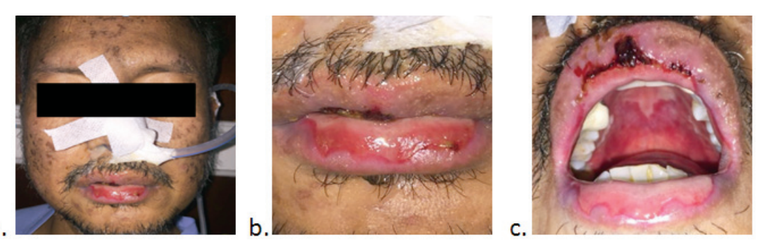
Figure 2. Oral lesions after nine days of treatment. a. Decrease in saliva around the lips. b. Hemorrhagic crusting of the vermillion zone of the lips was noted. c. Erythema of palatal mucous.

After 18 days of treatment, the oral lesions improved as shown in Figure 3. Chlorhexidinedigluconate 0.12% spray therapy was discontinued and the patient was prescribed 5 mg of prednisone in powder form in addition to 10ml of aguadest for daily rinses three times a day for ten days and 1% hydrocortisone cream for the upper and lower lip. Saliva was diluted and the intensity of saliva secretion through