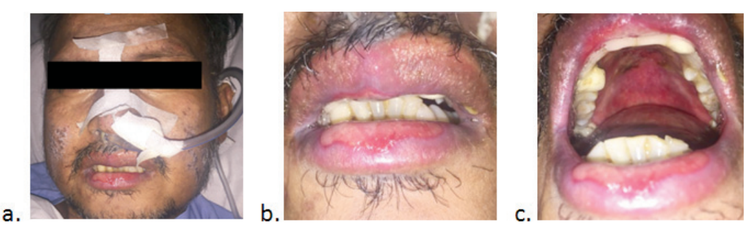
Figure 3. After 18 days of treatment lesions have improved. a. Absence of erythema on the face. b. Crusts on the lips have disappeared. c. The palatal mucous still featured an erythema.