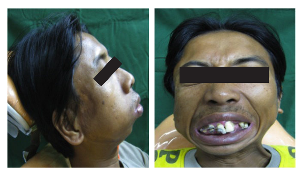
Figure 1. The profile of the patient showing "bird face" appearance indicating a severe mandibular retrognathism (left) and severe trismus (right).

Clinical examination showed facial asymmetry with large area of scar tissue on his right zygomatic and preauricular region, mandibular retrognathism, and severe trismus (Figure 1). Intra oral examination was difficult to perform due to the trismus. Panoramic x-ray showed ankylosis of the right temporomandibular joint whereas the left joint seemed somewhat normal with the presence of joint space (Figure 2). CT scan of the head revealed loss of the normal structure of the right temporomandibular joint showing large ossification area over the region (Figure 3). The diagnosis made was bony ankylosis of the right temporomandibular joint.