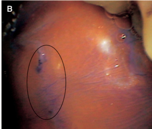
Figure 1. Photographs of the toluidine blue positive staining. The same region was persistently stained blue during the first (A) and second (B) staining.