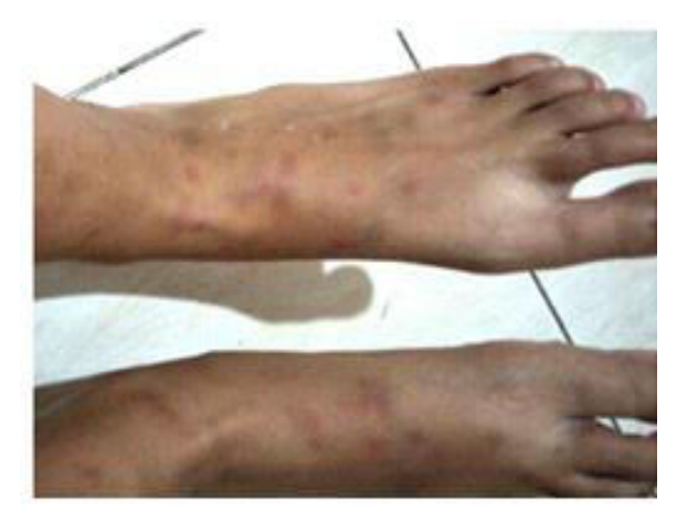
Figure 2. Lesions on the Patient's Leg