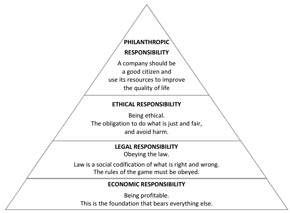
Figure 1: The pyramid of corporate social responsibility Source: Carroll, 1991

legal, ethical, and discretionary (philanthropic) expectations that society has from an organization at a given time (Carroll, 1979). Based on this definition, Carroll developed a diagram of corporate social responsibility in the form of a four-tier pyramid (Carroll, 1991), with economic responsibility at its base, as only a profitable company can contribute to the development of its community and the society at large. The next is legal responsibility, which is based on obeying the law, i.e., a company should conduct its business in accordance with the expectations of the state and its legislation. What follows is ethical responsibility, according to which a company's activities should be just and fair, and its business operations in line with the ethical principles and norms of the society and the community. The final responsibility that a company has towards the society and the community in which it conducts its business is philanthropic responsibility. It is the discretionary right of a company to be charitable and donate its resources, thus improving the quality of life in the society, i.e., being a good citizen in line with the society's expectations. In order for philanthropic responsibility to be sustainable in the long term, it is necessary at the same time to create value for the users and improve the business operations of the company. Socially responsible is only that company which meets all four dimensions of Carroll's pyramid (Figure 1).