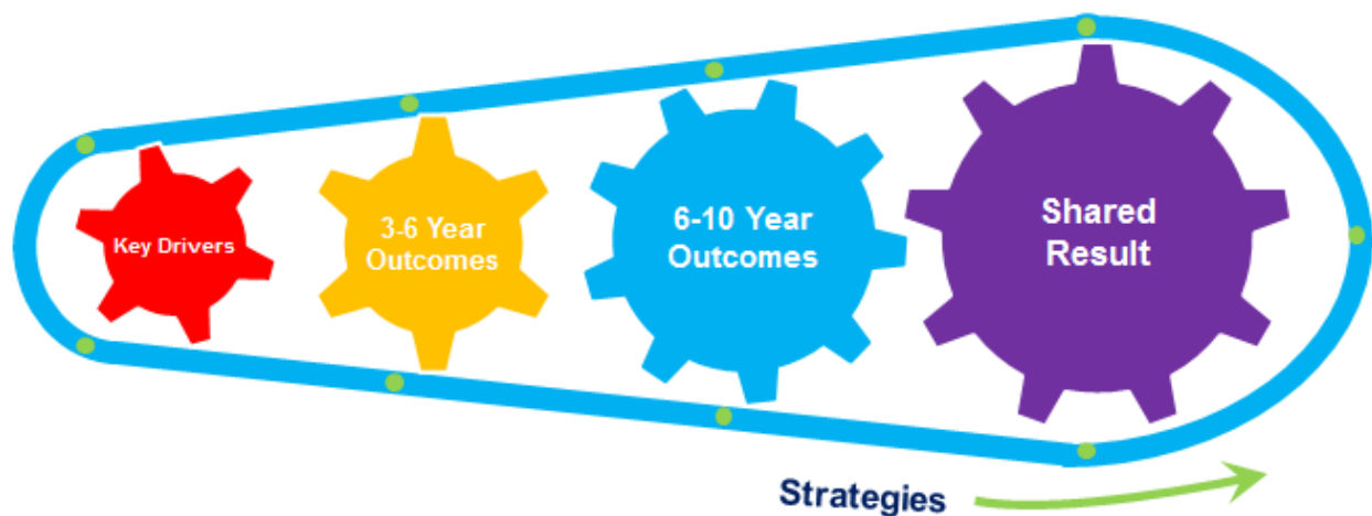
Figure 3. Data-Driven Feedback Loop.

population. The outcomes are divided up in to 3-6 year outcomes and 6-10 year outcomes to allow the collective impact initiative to think of its work in phases. Some progress can be seen early through changes in data, and some progress can only be seen after several years. Strategies are a coherent collection of activities, ideas and programs that drive changes towards a shared result.