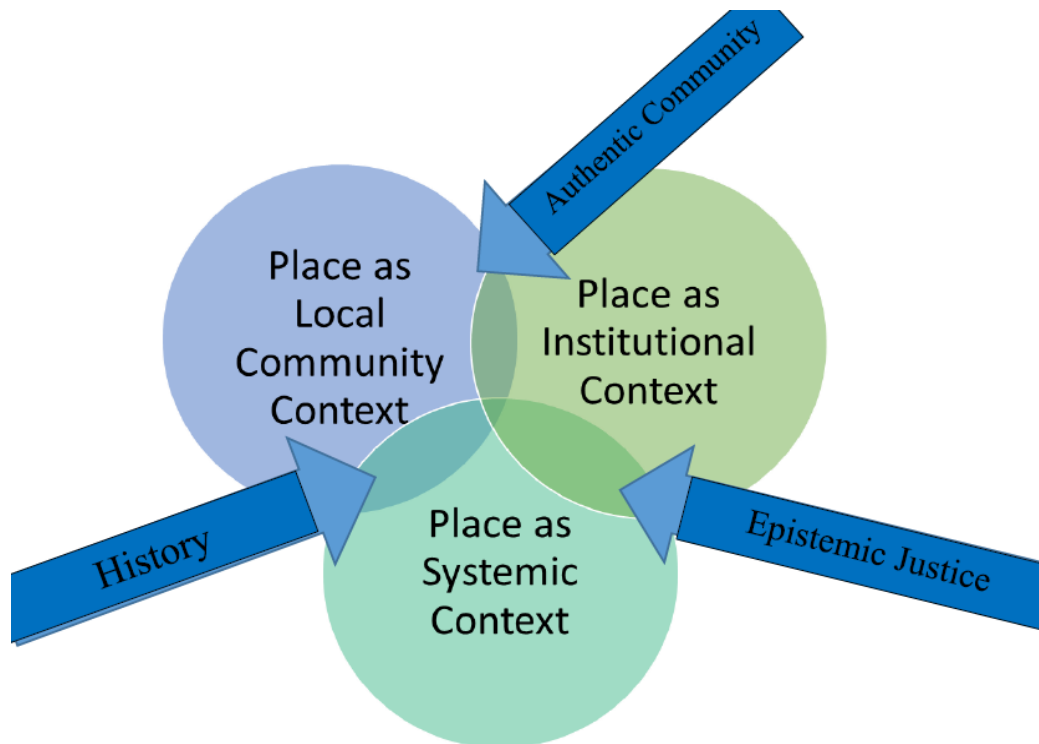
FIGURE 2. A framework for a pedagogy of place: The intersection of local community, institution, and systemic context.

place-based work and pointed toward community wisdom and community priorities as catalysts for a different approach to teaching (see Figure 2). We contend these are important contextualized pedagogical practices and encourage further inquiry into how place-based pedagogy reflects the unique contexts from which they emerge (Haarman & Green, 2021). The scholarly articles featured in this special issue will be highlighted, along with their emergent themes, as we discuss the emerging framework that surfaces from this inquiry (Figure 2).