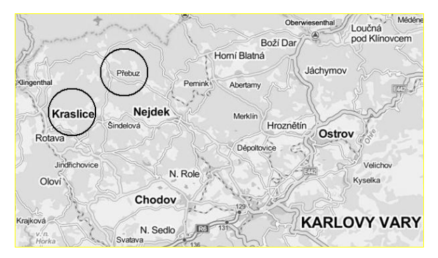
Fig. 1. Locality of Prebuz and Kraslice.

In the work two samples are described, namely from the locality of Prebuz and the locality of Kraslice. Fig. 1 shows the geological characteristic of the locality of Prebuz and Kraslice.