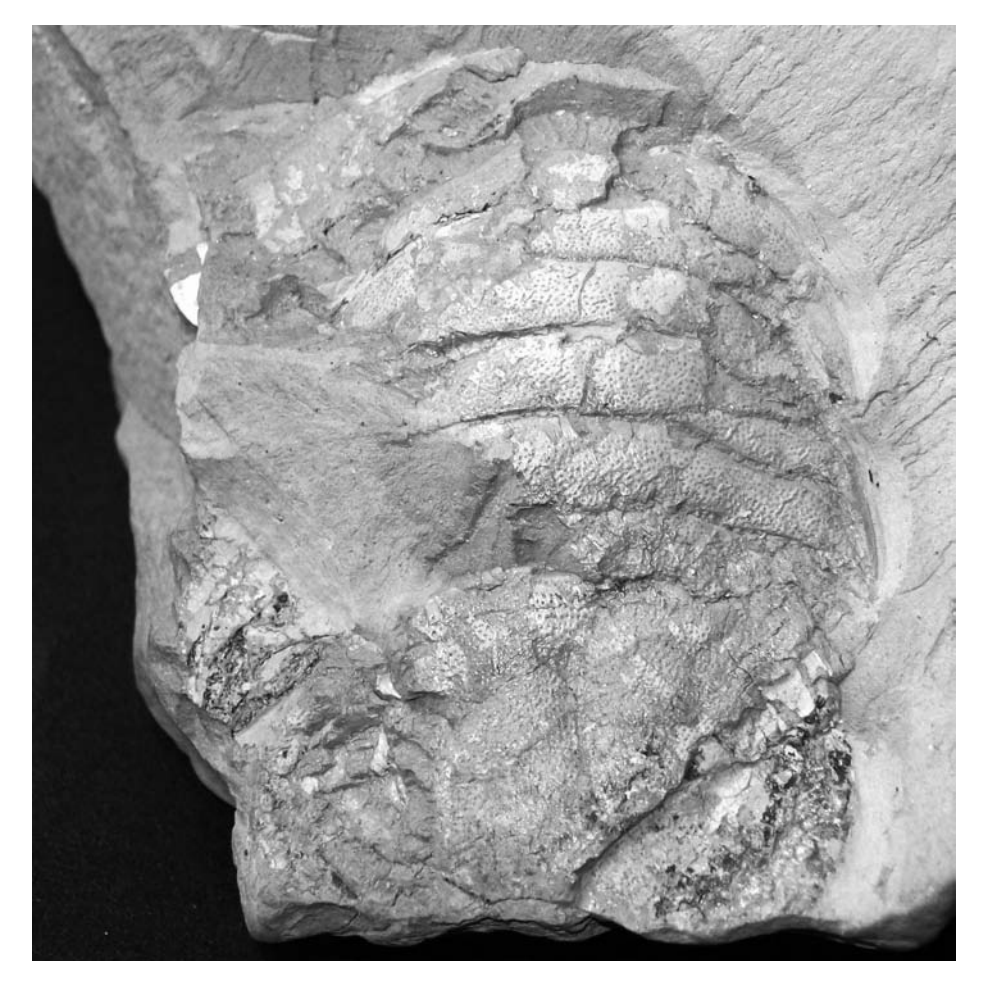
Fig. 1 - Palaega sp., MSNM i27547 (x 2.2).

Palaega sp. differs from P. sismondai in the pleonites not being short than pereonites and in lacking the lateral spines and the medial ridge on the pleotelson.