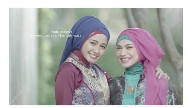
Figure 11: Confident Muslim Women

Voice: Dia yang memahami cantikku seutuhnya, dia yang membuatku tampil percaya diri (It is the one that fully understands my beauty that makes me look confident).