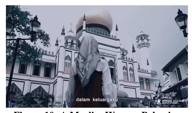
Figure 10: A Muslim Woman Behavior

Voice: Aku bisa menyalurkan kehangatan dalam keluargaku (I can channel warmth to all members of my family)