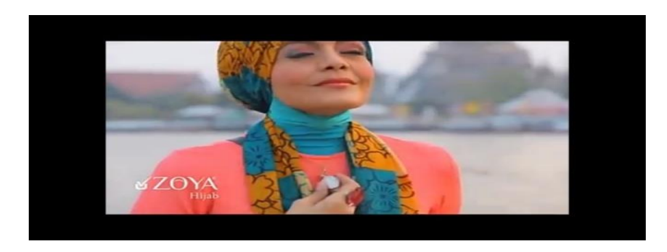
Figure 13: A Self-aware Muslim Woman

Voice: Dimanapun aku, selalu kuingat siapa diriku (Wherever I am, I always remember who I am).