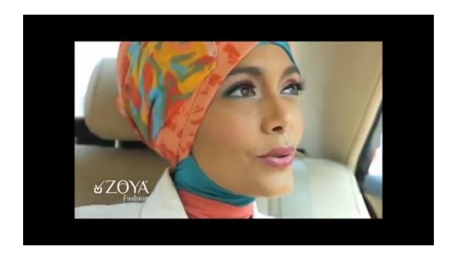
Figure 12: A Steadfast Muslim Woman

Voice: Setiap hari aku bertambah tegar, melihat lebih jelas melalui pencapaian dan pengabdian (Every day I become more determined to see more clearly through my achievement and devotion).