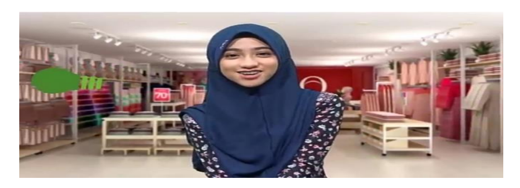
Figure 5: A Muslim Woman as a Student

Voice: Hijab bukan penghalang aku beraktivitas. Saatnya move on dalam Kerudung Sekolah Zoya. (Hijab is not a barrier for my activities. It's time to move on in the Zoya School Veil).