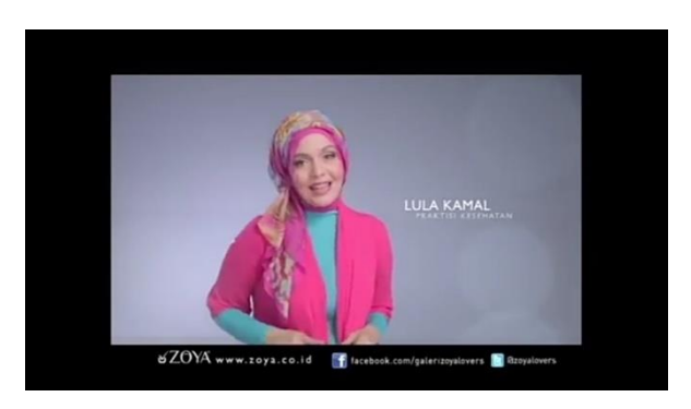
Figure 6: A Medical Doctor Muslim Woman

Voice: Sesibuk apapun saya selalu merasa nyaman dan cantik dengan Zoya (Although I am super busy, I always feel comfortable and beautiful with Zoya).