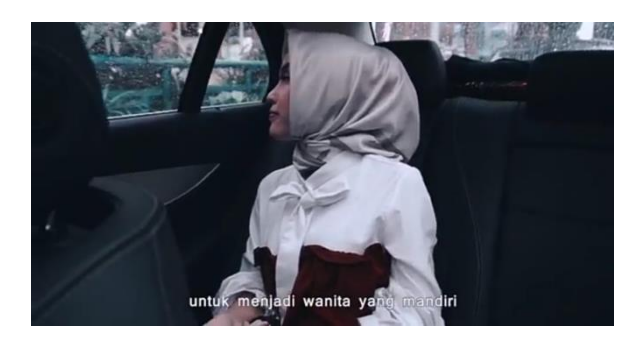
Figure 15: An Independent Muslim Woman

Voice: Jauh dari rumah membuat aku terlatih untuk menjadi wanita yang mandiri (Away from home makes me trained to be an independent woman).