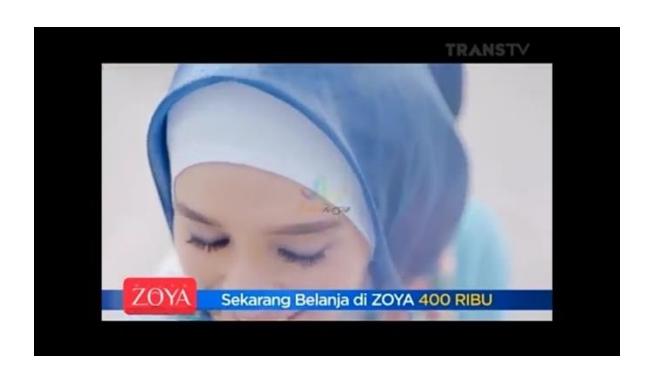
Figure 3: A Gorgeous Muslim Woman Physical Appearance

Voice: Waktu pertama berhijab semua orang bilang kamu cantik banget (For the first time wearing a hijab, everyone said you were really gorgeous).