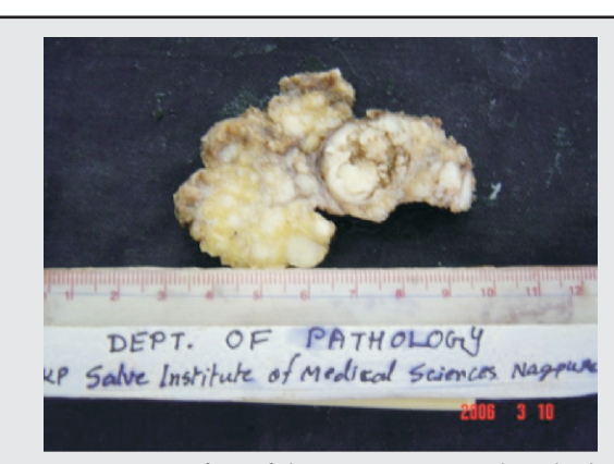
Figure 1: Cut surface of the tumour mass with multiple grayish white nodules surrounded by adipose tissue

myxomatous or mucinous. Hyalinization was seen in few areas. Foci of microcalcification and multinucleate giant cells were also present. The histopathology report was given as recurrent pleomorphic adenoma (RPA) of right submandibular salivary